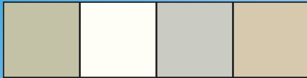
KHAKI COLONIAL WHITE WEATHERED GRAY CHATHAM TAN