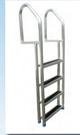
HEAVY DUTY LADDER