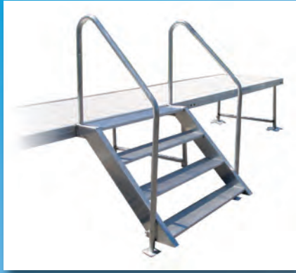
40" WIDE DOCK STEPS